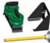
INN-EXPSL Flexo Sleeving Rapid Install Tool - Single Kit, No Stand