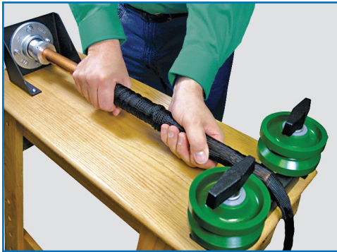
Step 1 Load sleeving over the tube.