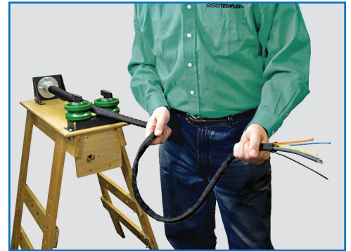
Step 3 Pull both sleeving and wire bundle to desired length.