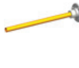
INN-EXPT063 Flexo Sleeving Rapid Install Tool - 3 ft. Tube Assembly