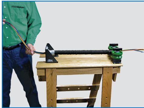
Step 2 Push wire bundle through the machine until it appears out of the tube.