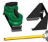
INN-EXPSS Flexo Sleeving Rapid Install Tool - Single Kit, Small