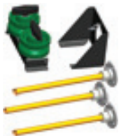
INN-EXPC Flexo Sleeving Rapid Install Tool - Complete Kit, Large, 6 ft.